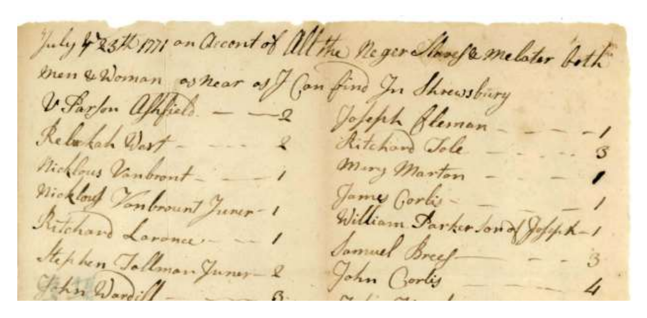
"An Account of All the Negro Slaves & Melatos both Men & Women as near as I Can find for Shrewsbury," July 23, 1771, Monmouth County Archives