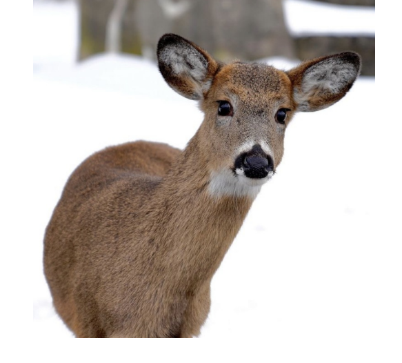
Looking for the Perfect Holiday Gift? Purchase a 2022 Calendar with Stunning Images of Sandy Hook