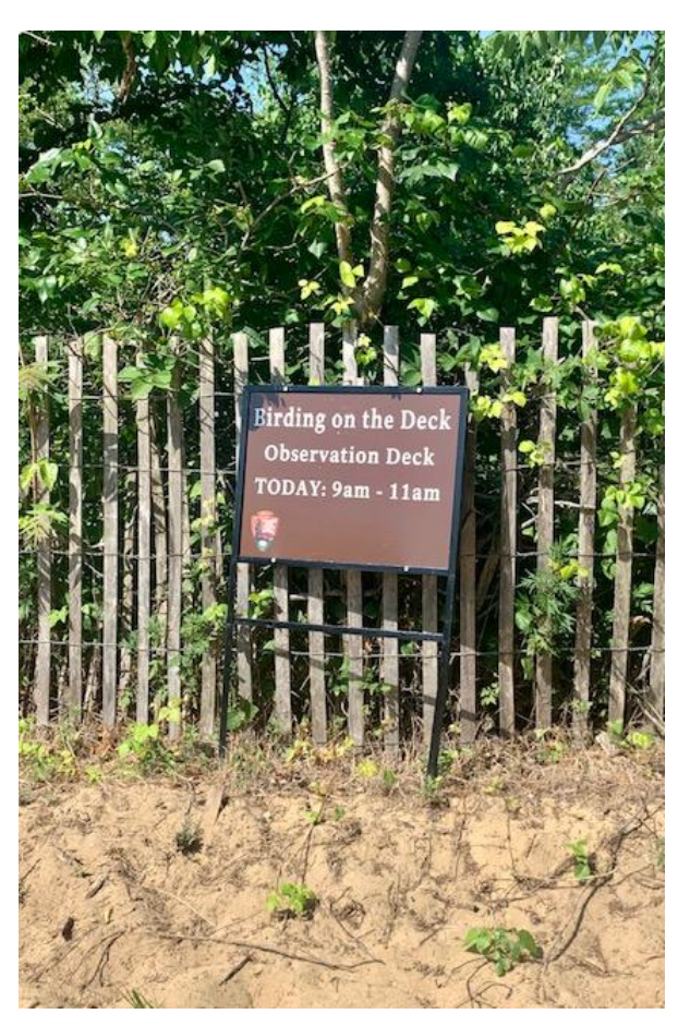
All Summer Long ...